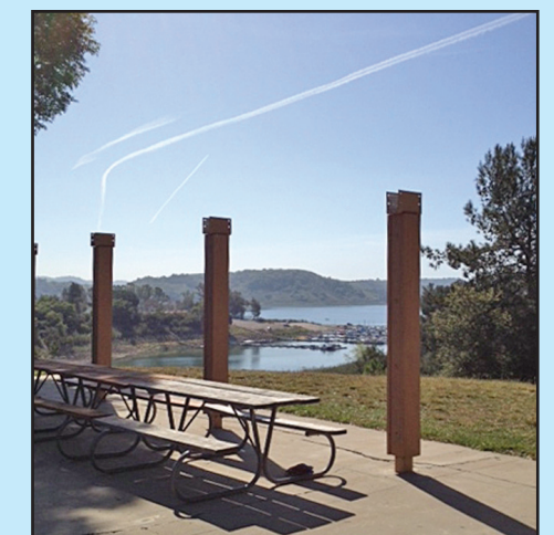
Teapot structure with old roof removed prior to new roof installation.

It is anticipated the new roof will be completed by the end of Summer 2013.