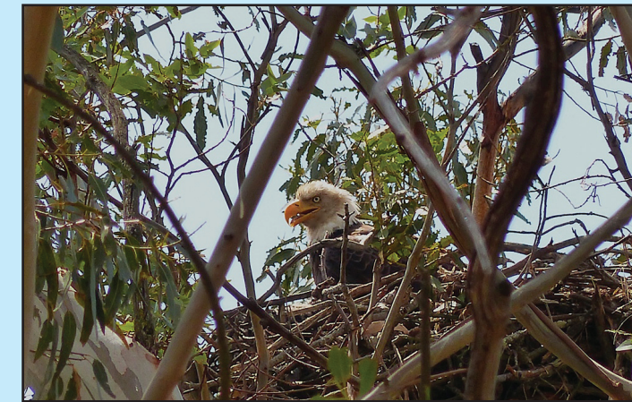
Nest with adult eagle near Lake Casitas.

A pair of young Bald Eagles hatched two chicks in a nest near Lake Casitas around April 6, 2013. The last recorded nesting of Bald Eagles on Ventura County's mainland was in 1922. The young adult pair was spotted over the last three to four years at the lake, but this is the first year they were successful in hatching chicks.